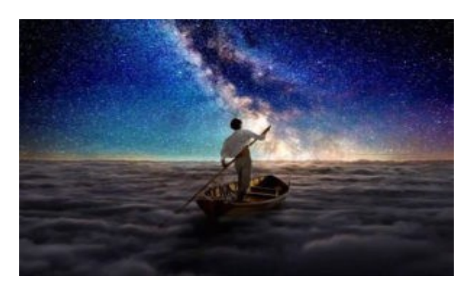
Negotiating the Ascension Path

A third group is somewhere in between: they are not quite awake to what is occurring yet, but they are not too caught up in the rampant negativity that exists among others, either. They will follow the first group into the Fifth Dimension – just somewhat later.