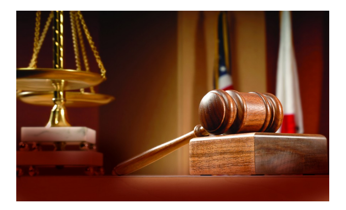
More Possible Good News

However, because the websites and social media of many of these intel providers have been infiltrated by the Cabal, some of what they say or write is not accurate. Indeed, little that you find on the internet these days can be one hundred percent believed; there is also misinformation on the alternative news sites, not just on mainstream media sites. It's important to be discerning and take anything you see or hear with a certain amount of salt.