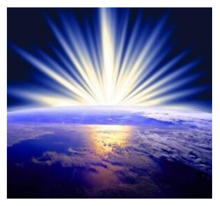
The Dimensional Shift

Another way to see it is that an old world is currently dying, and a new world is being birthed. It can just be difficult to see the new world at times while we're still in this chaotic period when great destruction of our old world and confusing transformation are happening all around us.