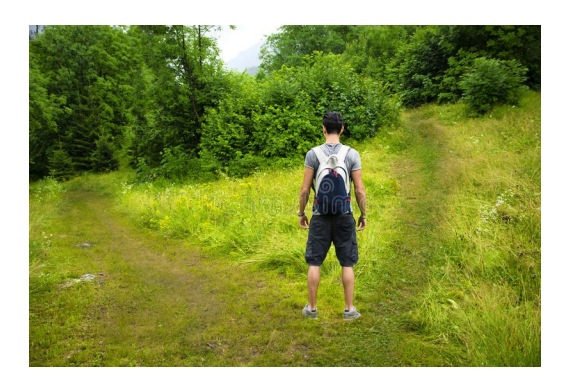
Humanity is Bifurcating

Even though it may look as if injustice, greed, war, manipulation and control are becoming more prevalent and stronger in the world today, in actuality, these conditions have all been here for many millennia; they are simply being revealed extremely clearly at this point. And, very importantly, these forces will eventually not survive in the world we are headed for. In 5D, only compassion, justice, harmony and unity in world affairs will eventually survive.