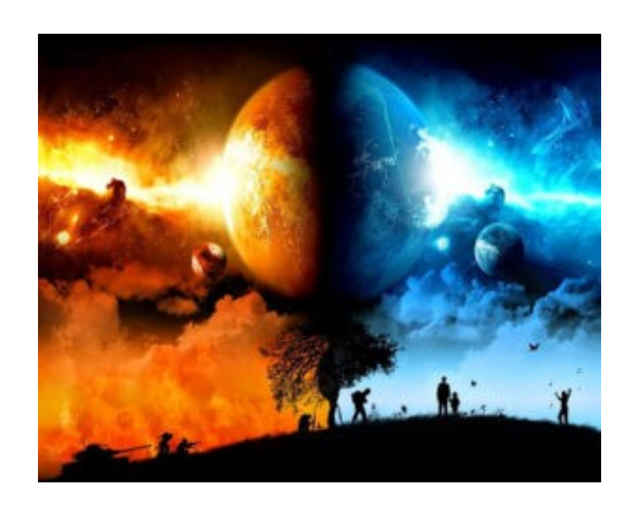
Why is the World Falling Apart?