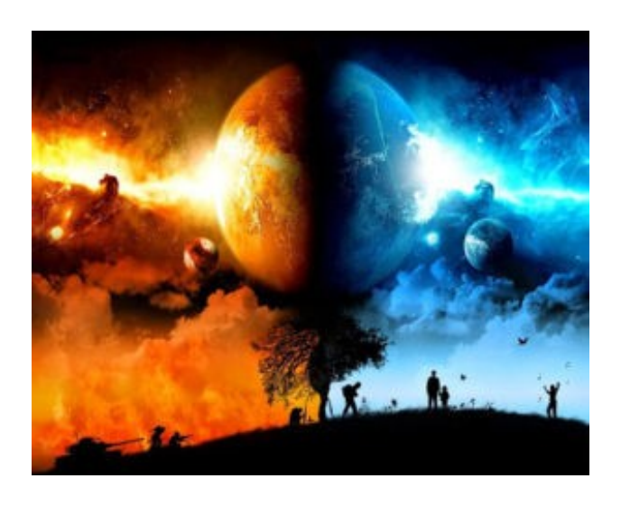
Why is the World Falling Apart?

If you're like most people on the planet these days, you are likely still trying to find your way through the dark and chaotic events that have been occurring since early 2020 – and you may well be in deep confusion and fear about what seems ahead of us. Understandably, you might feel a profound sense of despair about humanity's future.